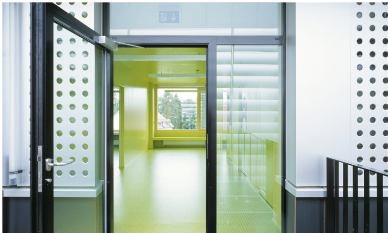
Spacious entrance area in the temporary school building