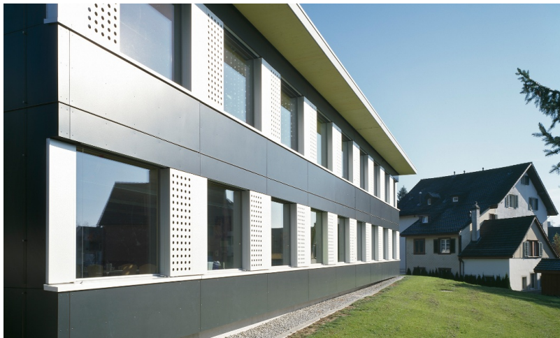
Temporary Hasenacker school building in modular design with facade in anthracite white