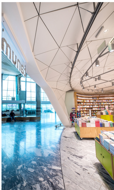
Close-up of clad timber construction