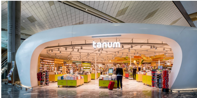
Pavilion in the transit zone