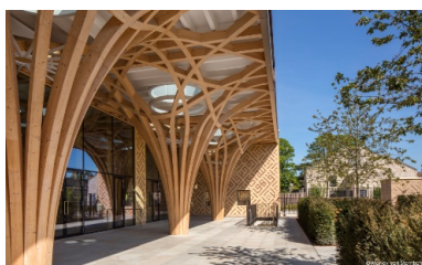
Entrance to the mosque