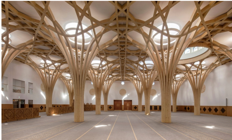
Prayer hall with free-form supporting structure