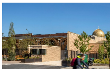
External view of Cambridge Mosque