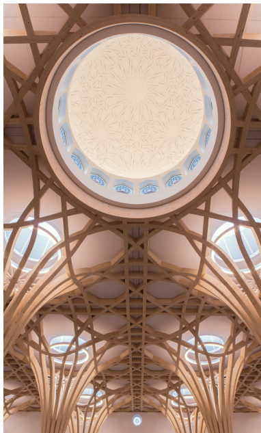
30 skylights bathe the mosque in light