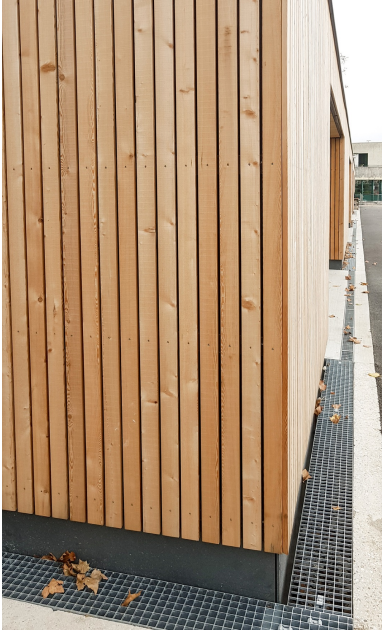
Vertical larch-wood slats form the facade.