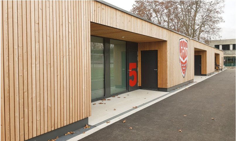
The single-storey stadium extension building contains changing rooms, showers and toilets.