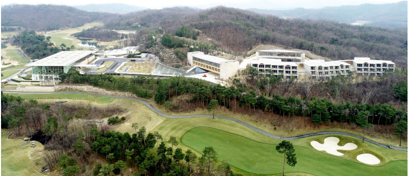
Bird's eye view of all buildings